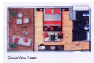
Ocean View Room

These spacious, elegant and comfortable rooms with a balcony offer beautiful views of the Matavai Bay, sunsets over Moorea or the Lafayette Beach. The décor is a tasteful mix of contemporary style and Polynesian influence. Our ocean view Tahiti hotel rooms feature one king size bed or two double beds.